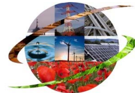
Chair Modeling for sustainable development